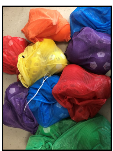
A special thank you to School Council for funding the outdoor equipment for all of our classes. With the warm weather hopefully around the corner, the students should be able to enjoy these soon!

Break. Students are very excited to find out if they have won any of the amazing prizes and experiences. We would like to express our thanks to all families for their support of this annual fundraiser. This year we raised just over $12,000. Funds raised will be used to help us purchase resources, equipment and technology to support our students as they learn, play and explore.